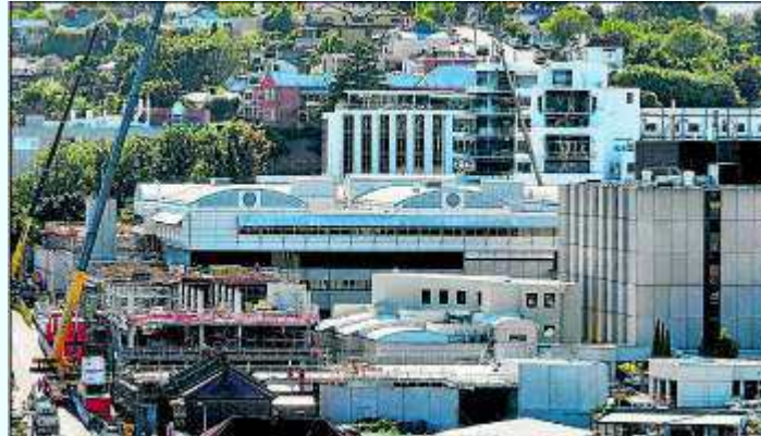
There has been no progress on waiting times for elective surgery patients, the Health Department says.

This was despite significant increases in the volume of